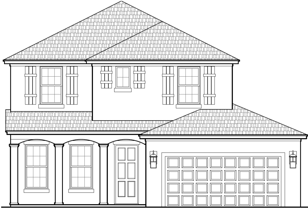
CONTEMPORARY ELEVATION - A