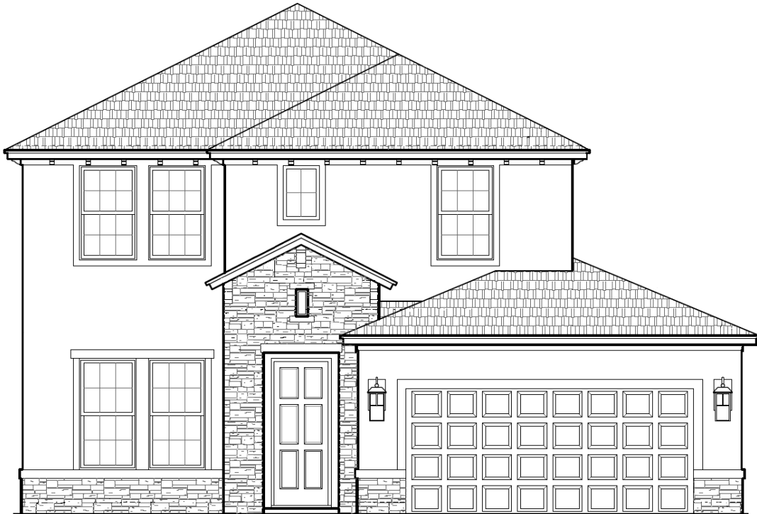
TUSCAN ELEVATION - B

Plans and specifications are subject to change without notice. Dimensions are approximate and may vary slightly with actual construction.